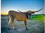
Jolta Showstop Rain