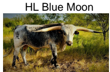
HL Blue Moon

He placed 2nd in his class at the Southeastern Winchester futurity!! Won Reserve Grand Champion