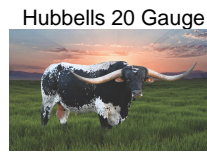
Hubbells 20 Gauge