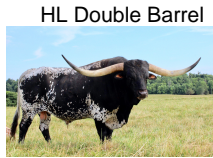
HL Double Barrel