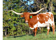
HUNT'S RESPECTED DIANNE