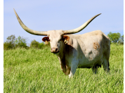
JBM SITTIN BECCA