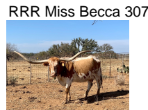
RRR Miss Becca 307